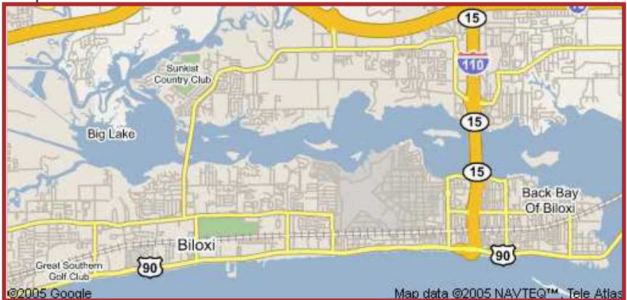
Map 2: Biloxi

Biloxi City's narrow peninsula has a complex land-use structure, which consists of a mixture of hotels, motels, restaurants, and bars that are entangled with residential areas and the Kessler Air Force Base, with its 4,668 members of the armed forces. Eight gambling casinos were located offshore, along scenic highway 90, before being destroyed by the storm. The population of Harrison County is about 189,601 with African Americans comprising about 21% (39,984) of the residents, and Asians and Latinos comprising about 8%. About 28% (53,000) of the regional population lives in Biloxi City. African Americans (19%), Asians (5%), and Latinos (6%) comprise about 30% of central city population. This indicates that high levels of population decentralization are a characteristic feature of the Biloxi region. For example, about 74% of regional whites, 76% of black, and 60% of Asians and Latinos live in the suburban region. This pattern appears typical of small cities and towns in the south.