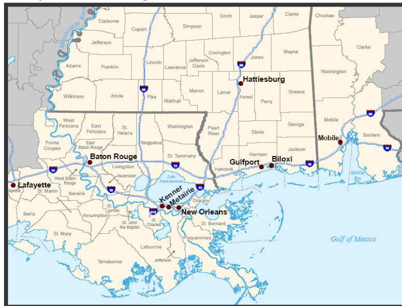
Map 1: The Gulf Region

This briefing report is based on my visit to Biloxi, Mississippi on Friday, November 11, 2005. Situated in Harrison County, this resort city is located about 75 miles west of New Orleans, and sits on a peninsula: the Gulf of Mexico is to the south, the Bay of St. Louis to the east, and the Big Lake and Back Bay of Biloxi to the north. The Back Bay of Biloxi separates the urban core from the suburban region and structures a residential environment that situates some of the highest priced housing in the region along the beaches lining the Big Lake and Back Bay (Maps 1-2). 1